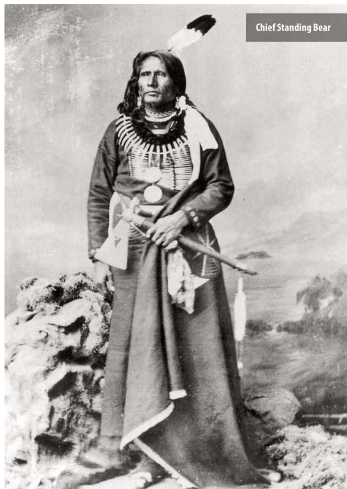
Chief Standing Bear